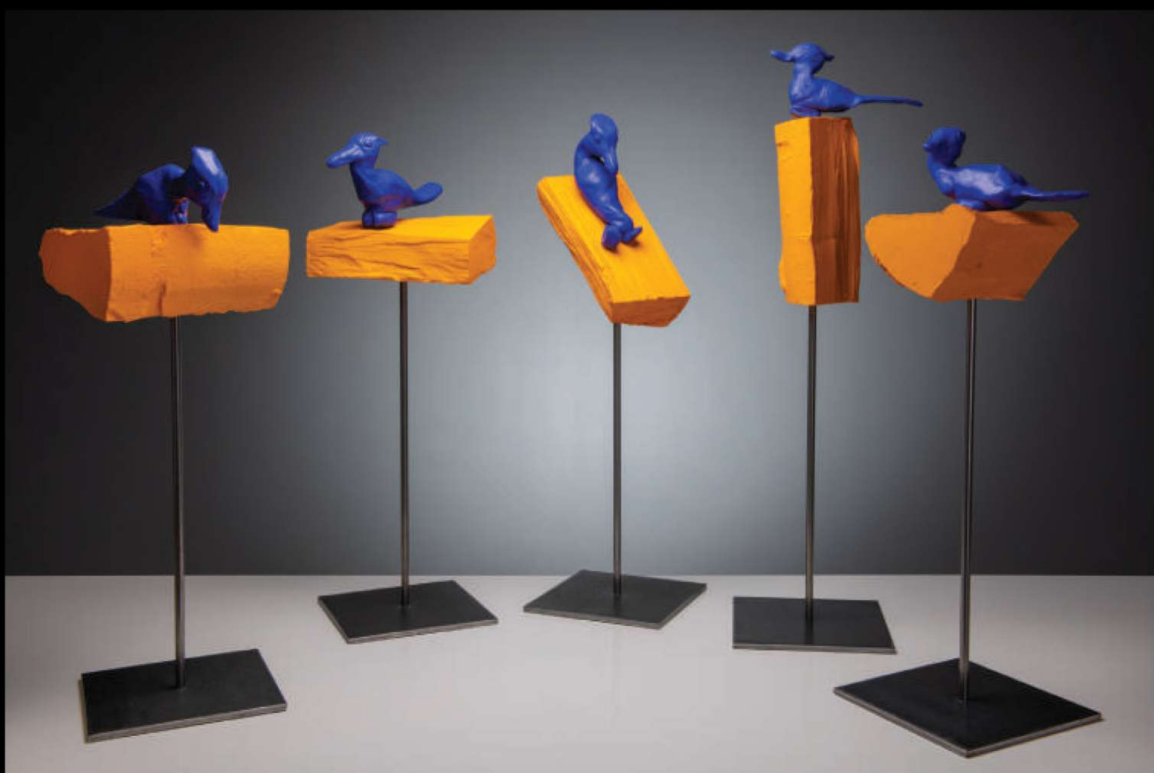
On the Beach , 30x20 cm (x 5), Keramiplast, Wood, Metal, 2019