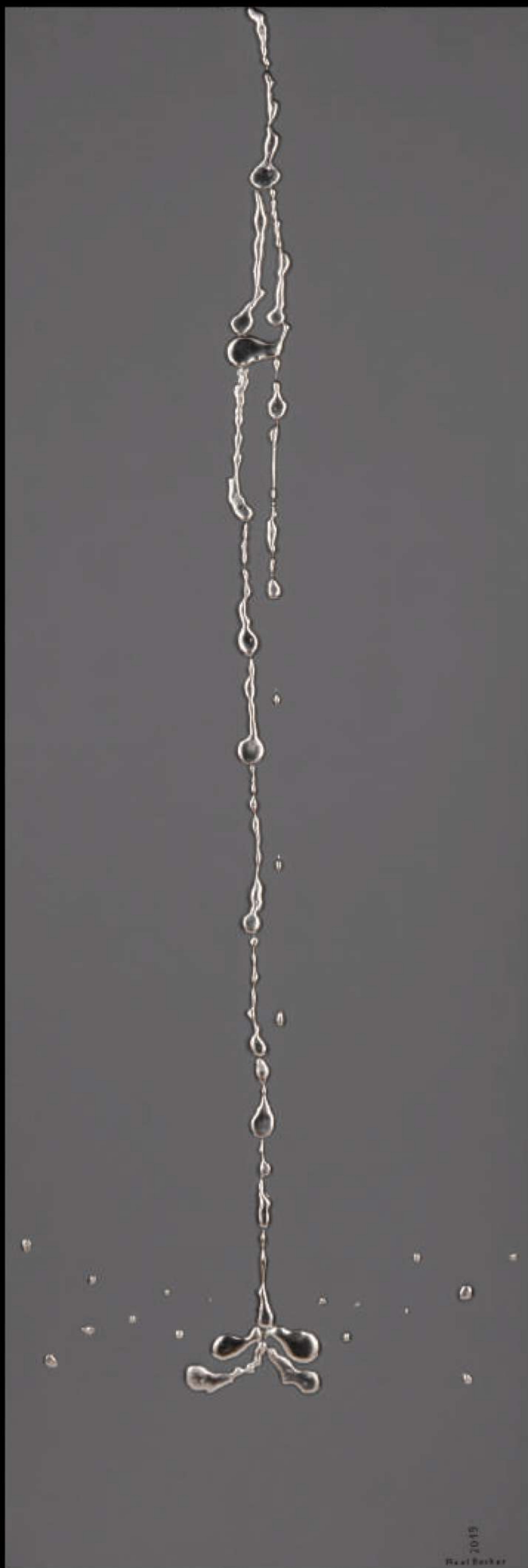
Waterfal - grey, 40x120 cm, Acrylic, Tin, Canvas, 2019