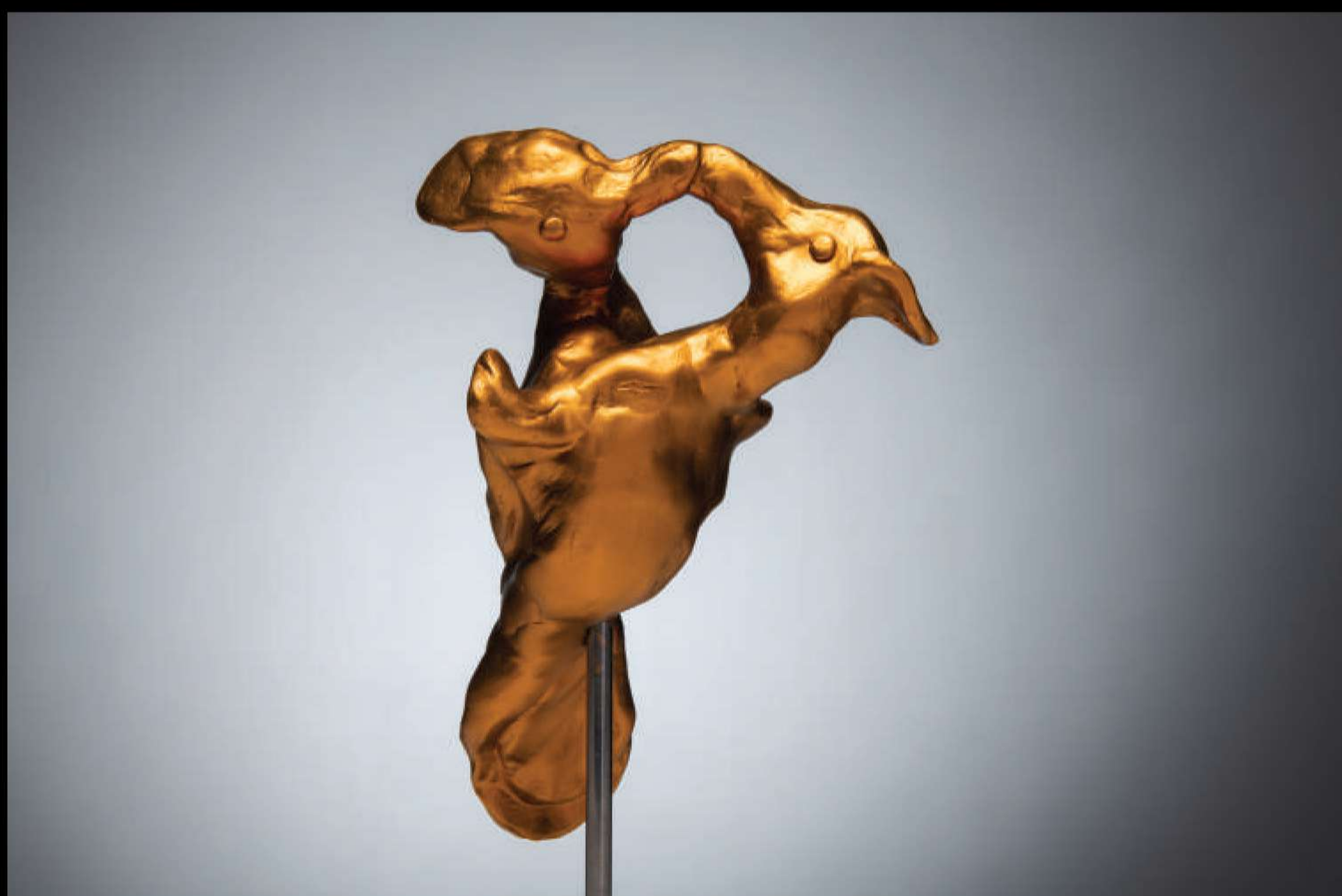
Love , 45x16 cm, Keramiplast, Metal, 2019