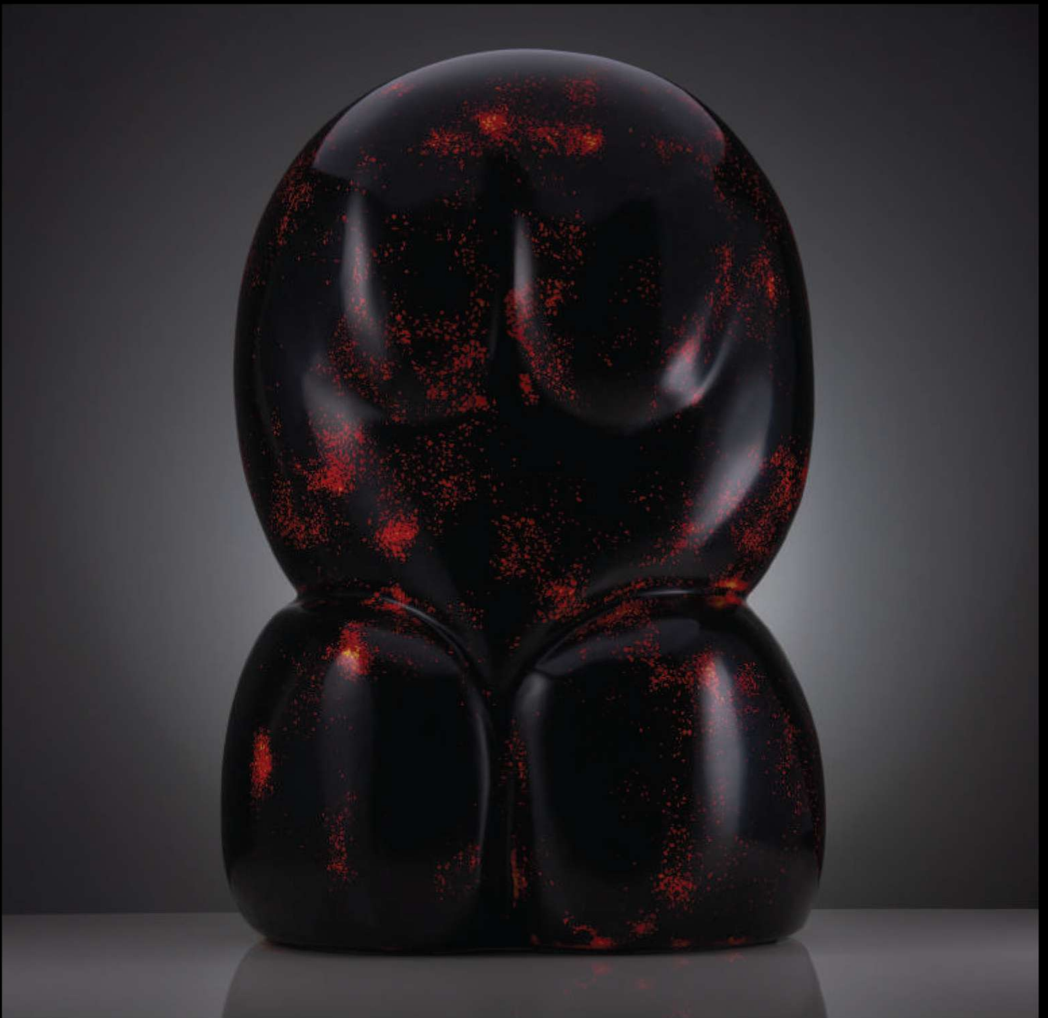
Sculpture – Beginning I , 73 x 53 cm (front), Painted Fibreglass, 2019