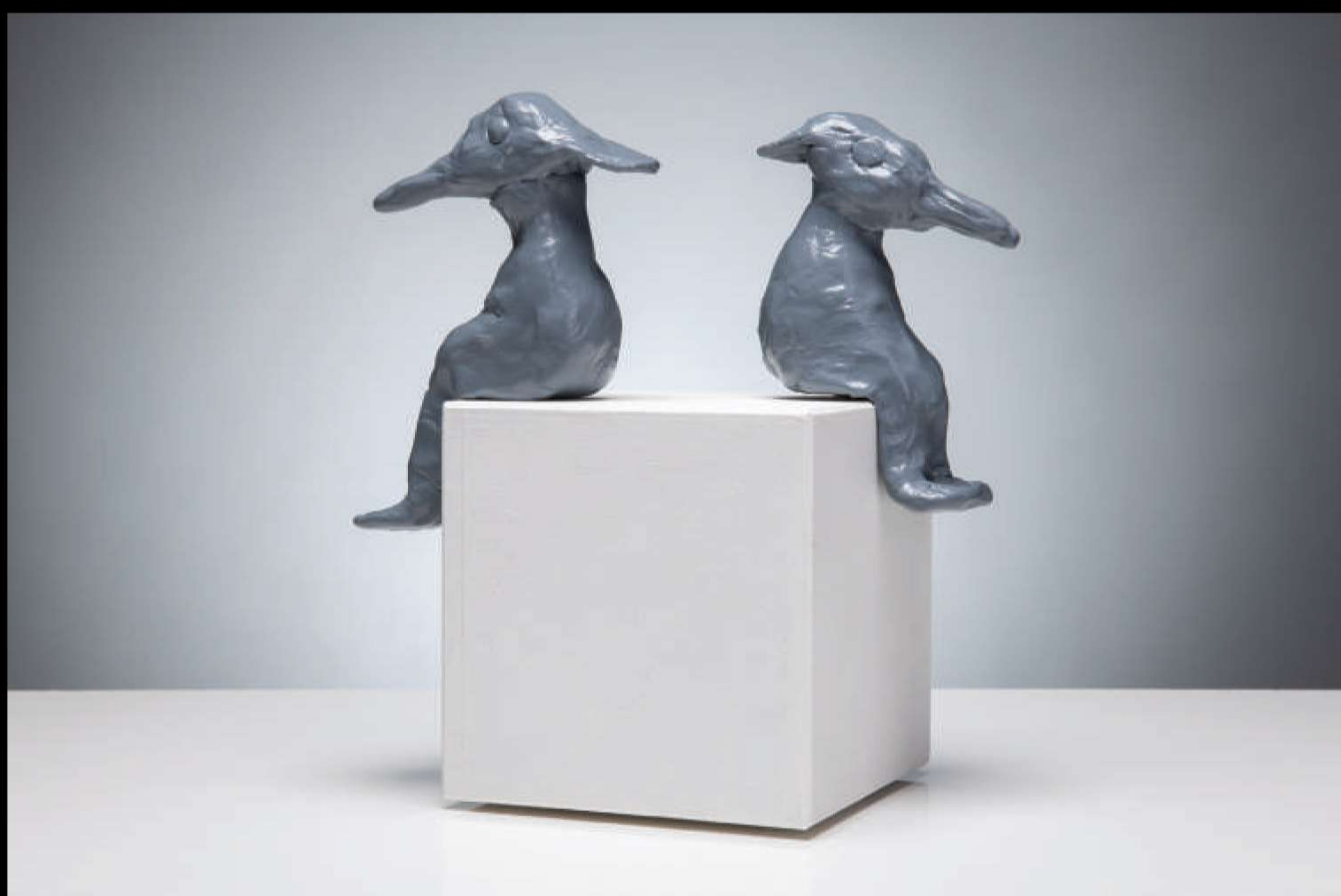
Banker , 28x25 cm, Keramiplast, Wood. 2019