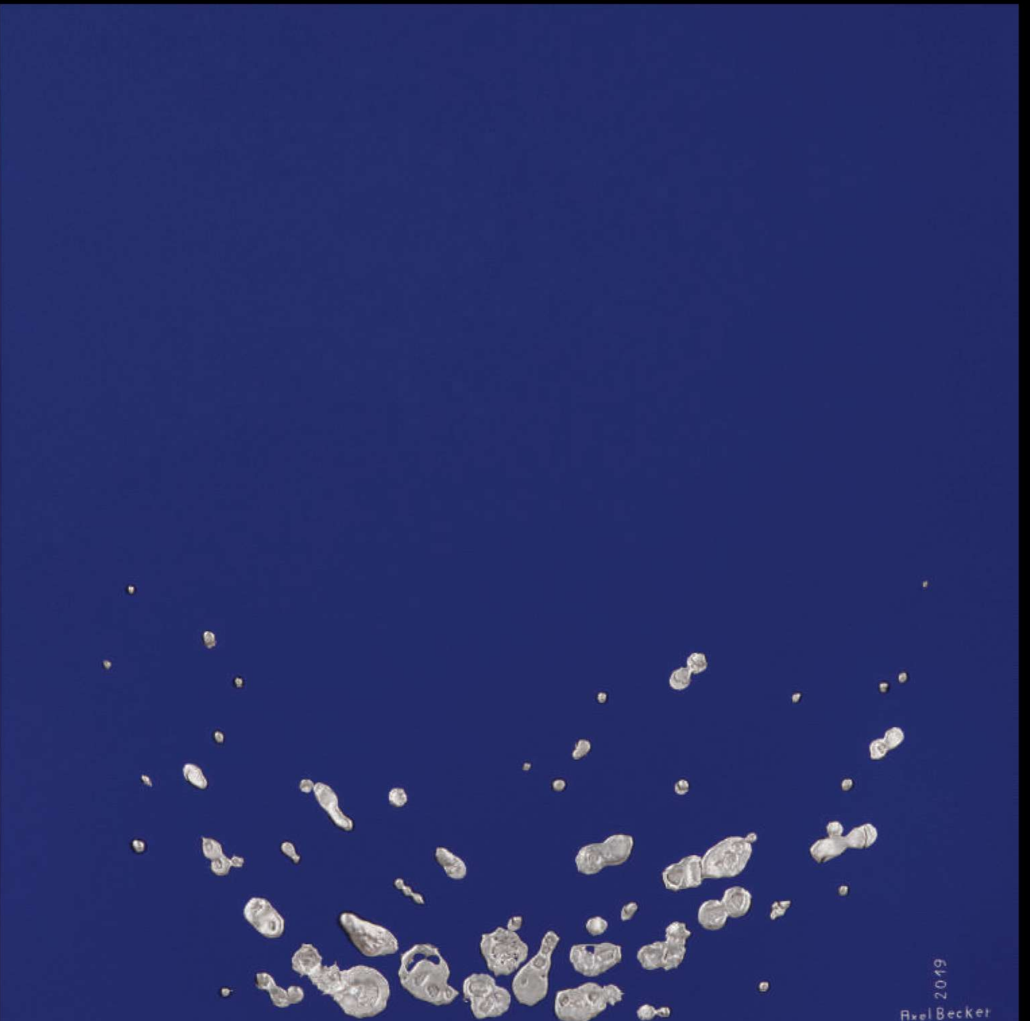
Splash - blue, 60 x 60 cm, Acryl, Tin, Canvas, 2019