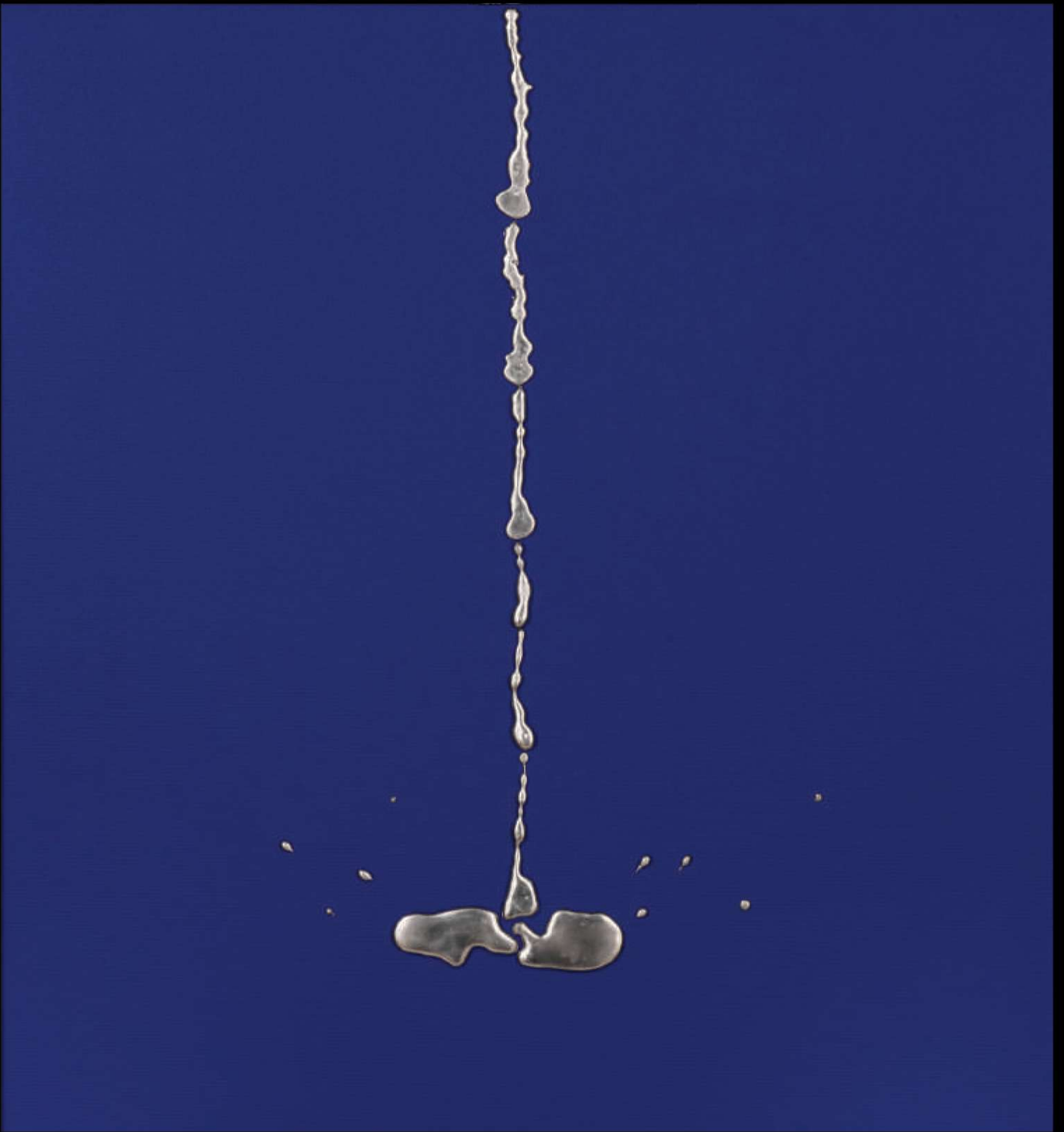
Waterfal - blue, 60 x 80 cm, Acryl, Tin, Canvas, 2019