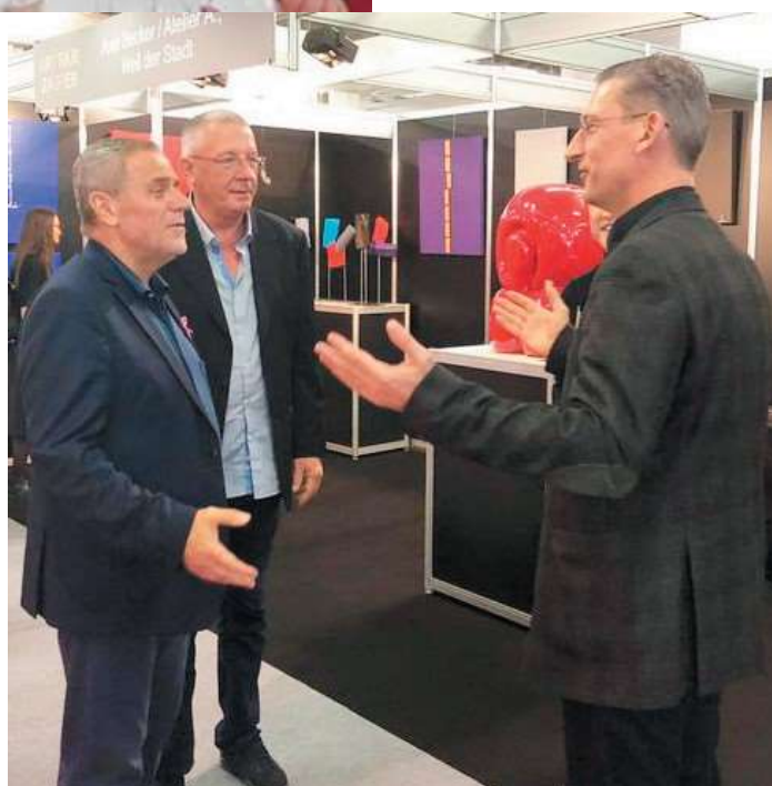
Art Fair Zagreb was also visited by Milan Bandić